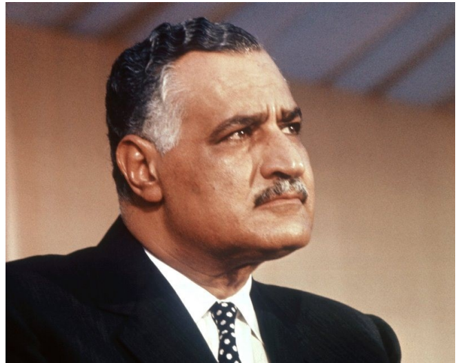
Gamal Abdul Nasser

to the Assad regime, which as is well-known has distributed pro-Nazi material denying the Nazi holocaust for decades, to Mahmoud Ahmadinejad, the former Iranian president, who organised international conferences to debate the historicity