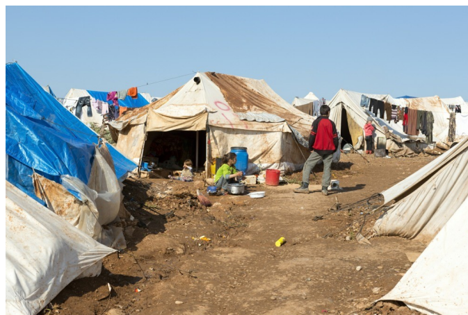
Syrian Refugee Camp

Russia provided political support and military aid from an early stage in 2011, eventually with direct military involvement from 30 th September 2015 onwards. Russian involvement has brought stability to the government and has allowed it to hold on to power and recapture lost territory with only the last rebel held area of Idlib remaining.