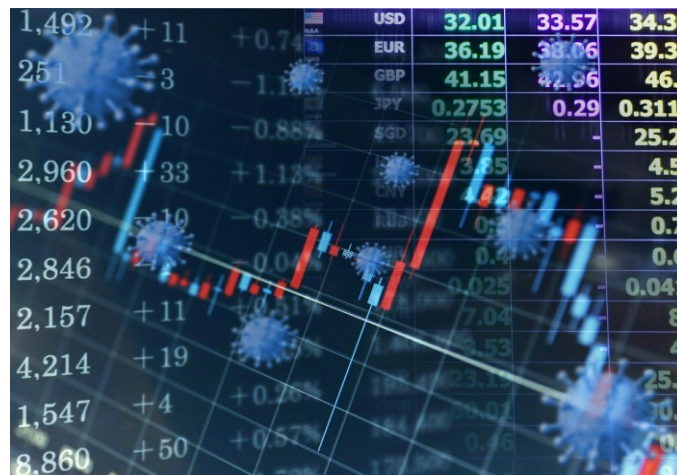
Stock Market Meltdown

The British media today report that the Johnson's government will bring in sweeping emergency powers to be given to the Police, which would allow them to detain people with the virus, reduce elderly care and force schools and nurseries to stay open if they are 'deemed to have closed unnecessarily'.