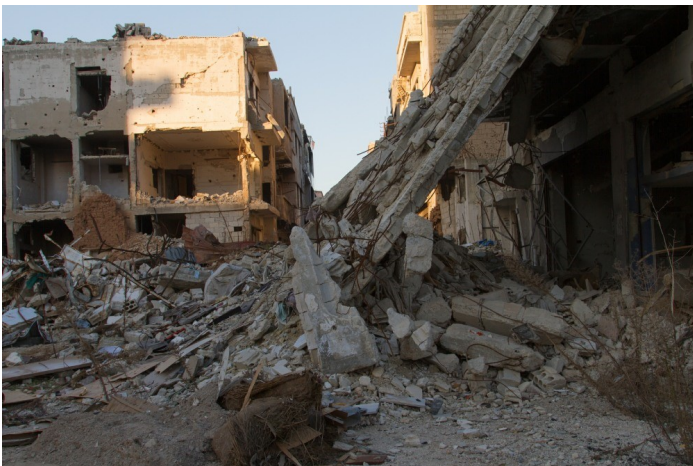
Devastation in Homs, Syria

Greek border guards have been firing tear gas at refugees with film footage being published online of the coastguard threatening to ram boats filled with refugees, with one film showing attempts to puncture an inflatable dinghy with a boat hook. This week there have been reports of a warehouse housing supplies for refugees being burnt to the ground on the Greek island of Chios and a school for refugees on the island of Lesbos being torched. Many of these camps on the Greek islands are overcrowded with people living in inhumane conditions with a complete lack of medical care.