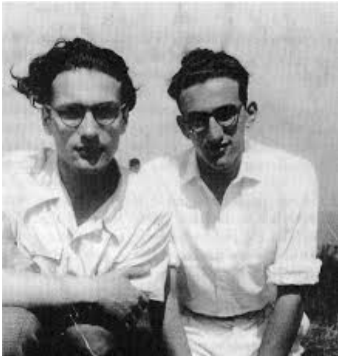
Ernest Mandel and Abram Leon

progressive elements of the Jewish population itself. Again in a dialectical sense, this can be seen as a quite novel, if fearsome and colossally destructive, manifestation of class struggle within the Jewish population as a class-differentiated remnant of the people-class that they once were.